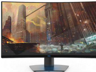
Dell Gaming 32 Monitor | S3220DGF