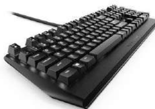
Alienware Mechanical Gaming Keyboard | AW310K