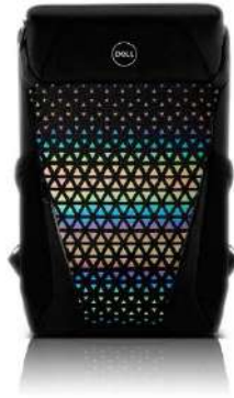
Dell Gaming Backpack 17 | GM1720PM