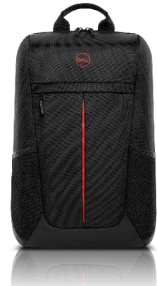
Dell Gaming Lite Backpack 17 | GM1720PE