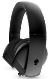
Alienware Stereo Gaming Headset | AW310H