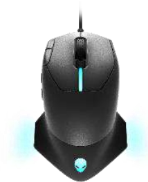
Alienware Wireless Gaming Mouse | AW310M